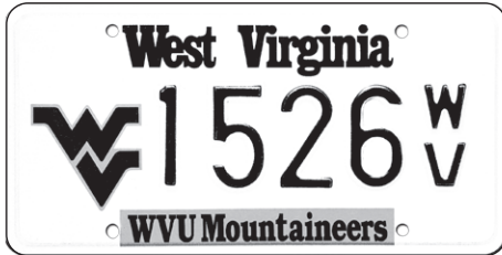
PLATE SAMPLE A) Applicant/Owner(s) Information