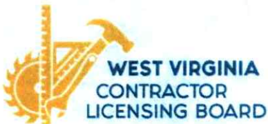
Chair, West Virginia Contractor Licensing Board

A copy of this license must be readily available for inspection by the Board on every job site where contracting work is being performed. This license number must appear in all advertisements, on all bid submissions, and on all fully executed and binding contracts. This license is non-transferable. This license is being issued under the provisions of West Virginia Code, Chapter 30, Article 42.