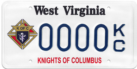
PLATE SAMPLE A) Applicant/Owner(s) Information Use Name(s) of Owner(s) as shown exactly on current registration card that you wish to register the license plate.