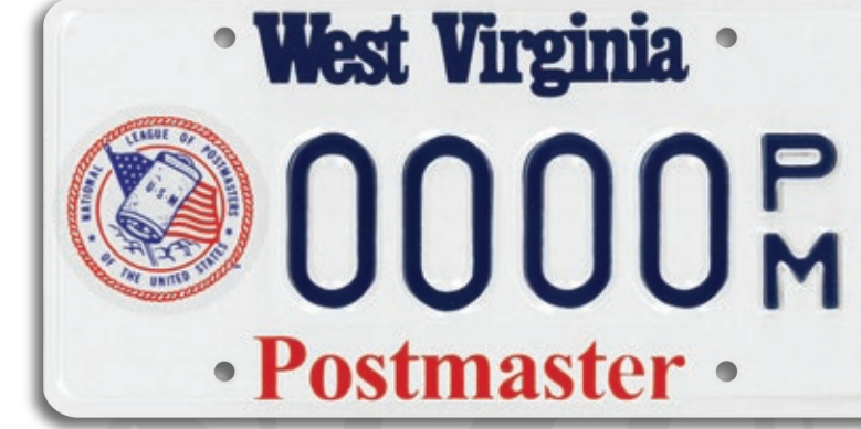
LEAGUE OF POSTMASTERS