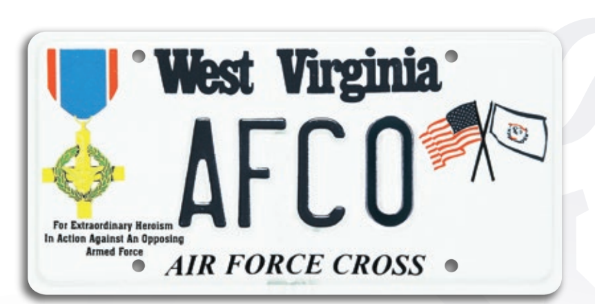
AIR FORCE CROSS