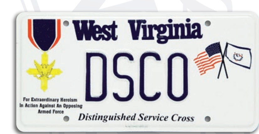
DISTINGUISHED SERVICE CROSS