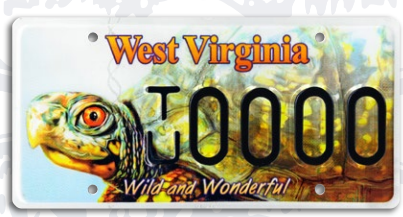
WILDLIFE - EASTERN BOX TURTLE