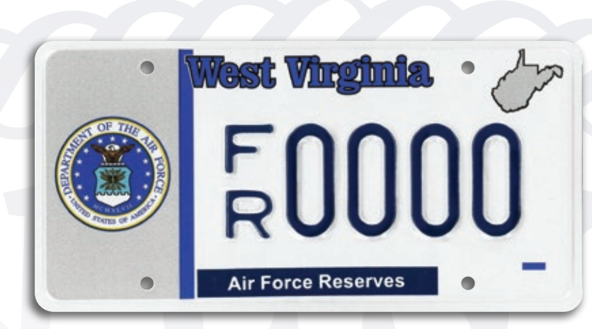
AIR FORCE RESERVES