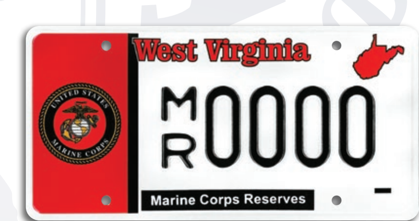
MARINE CORPS RESERVES