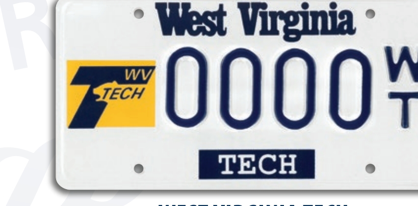
WEST VIRGINIA TECH