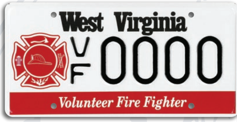
FIRE FIGHTER - VOLUNTEER