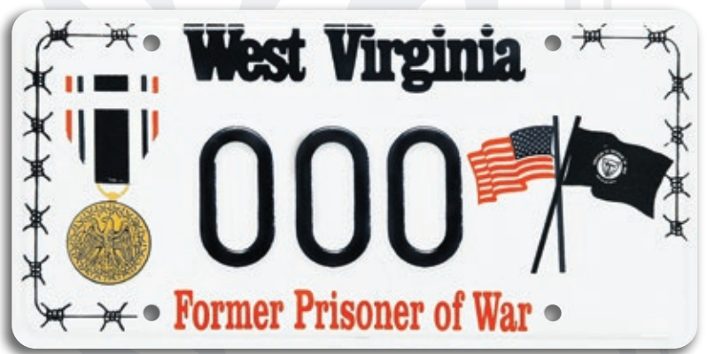
FORMER PRISONER OF WAR