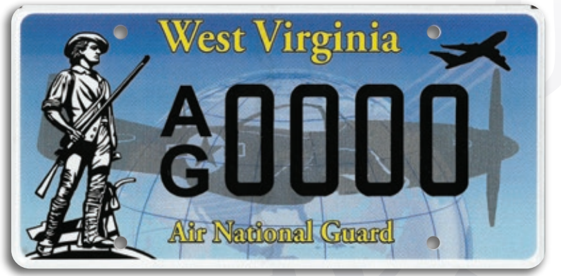
AIR NATIONAL GUARD