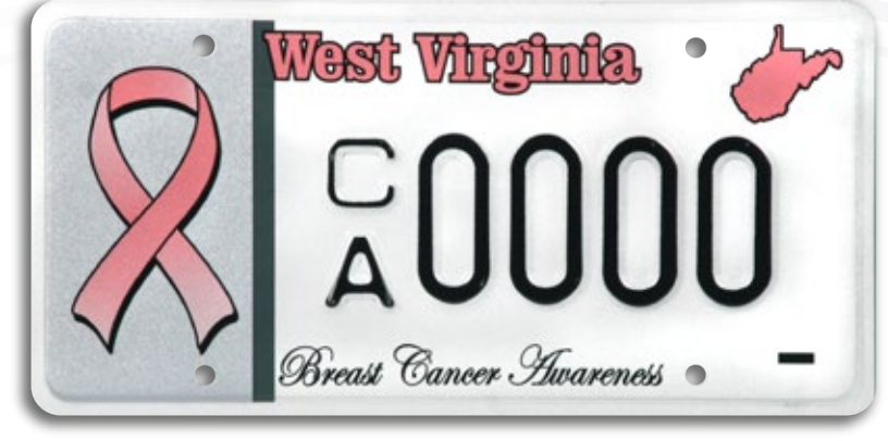
BREAST CANCER AWARENESS