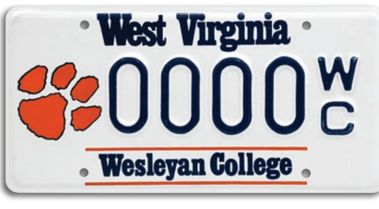
WEST VIRGINIA WESLEYAN COLLEGE