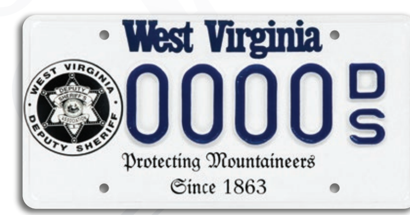
DEPUTY SHERIFFS ASSOCIATION