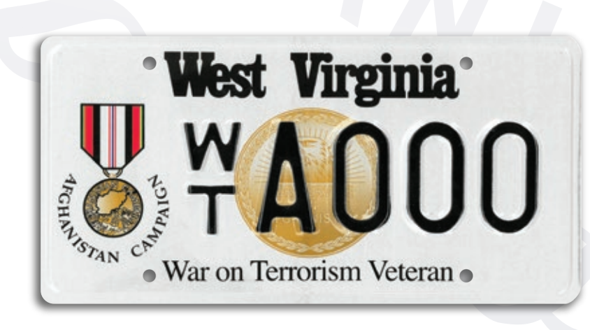
WAR ON TERRORISM VETERAN - AFGHANISTAN