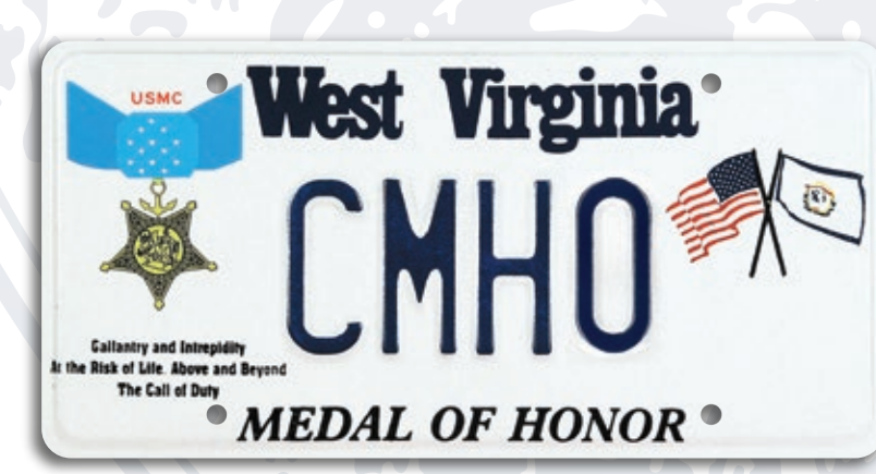
MEDAL OF HONOR