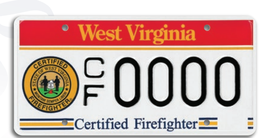
FIREFIGHTER - CERTIFIED