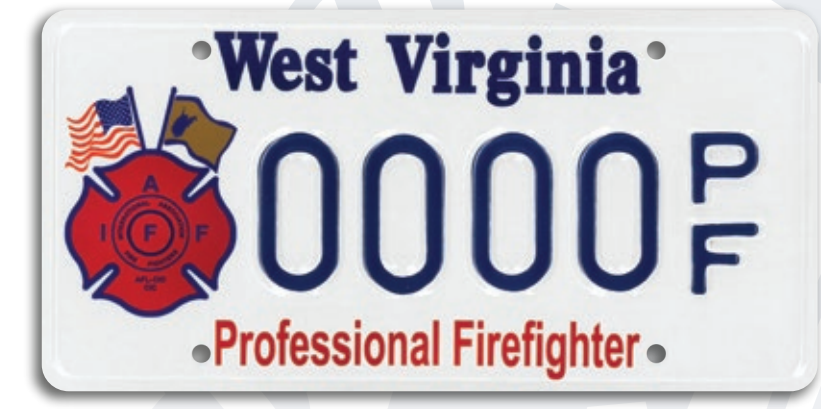
FIREFIGHTER - PROFESSIONAL