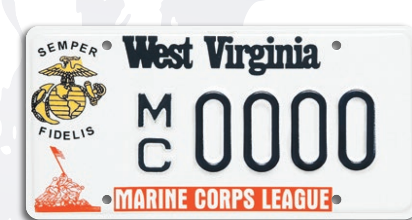
MARINE CORPS LEAGUE