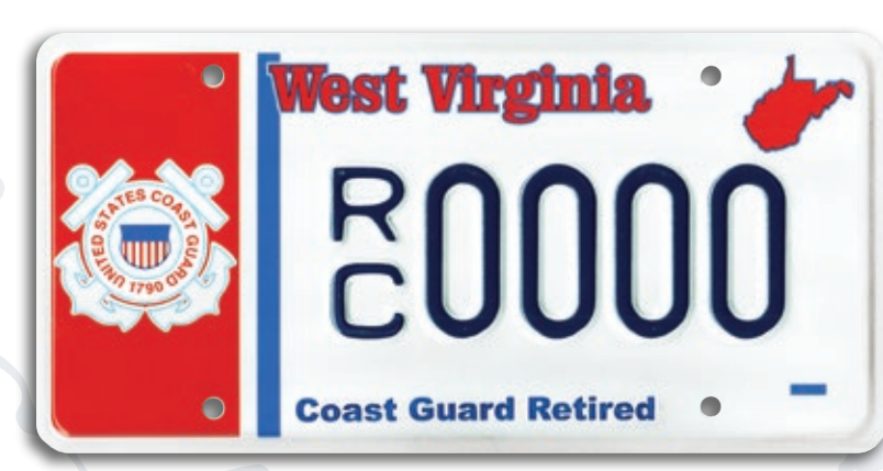
COAST GUARD RETIRED