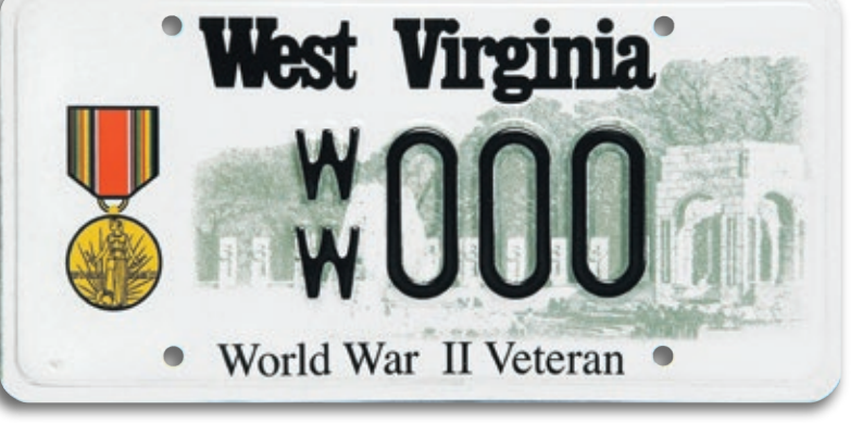
WORLD WAR II VETERAN