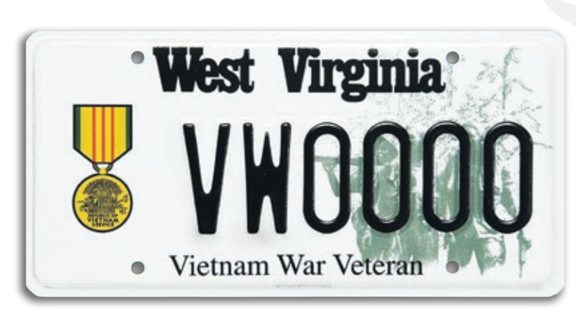
VIETNAM WAR VETERAN