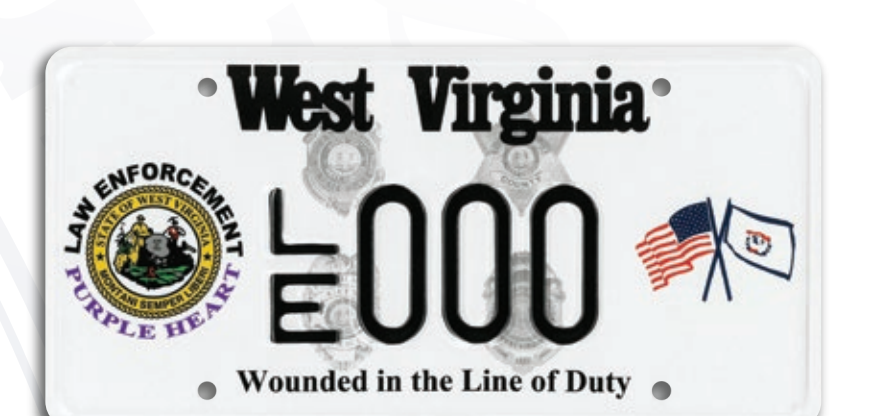
LAW ENFORCEMENT: WOUNDED IN THE LINE OF DUTY