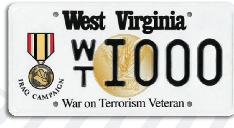
WAR ON TERRORISM VETERAN - IRAQ