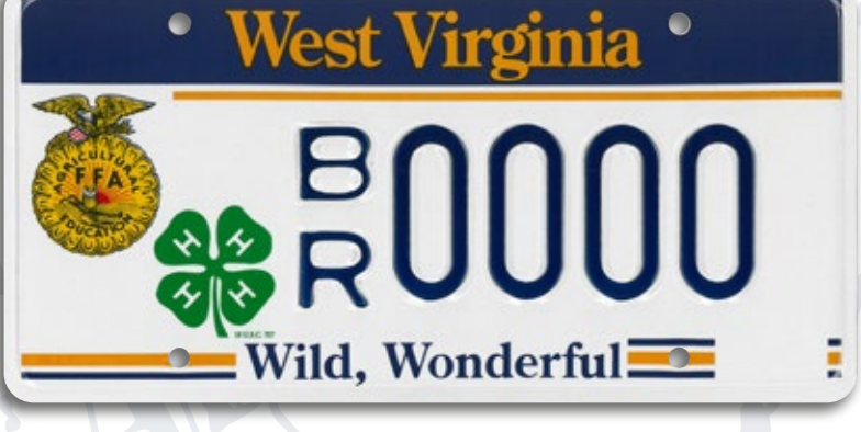
FFA - 4H