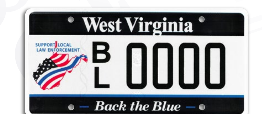
BACK THE BLUE