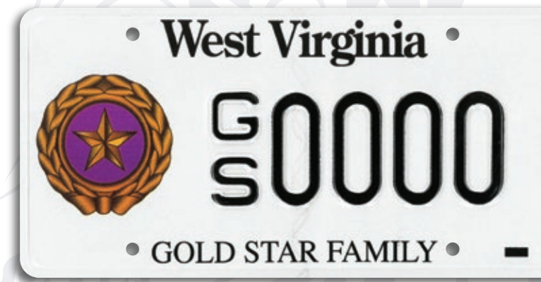
GOLD STAR FAMILY