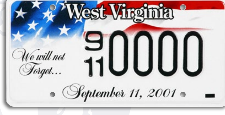
SEPTEMBER 11, 2001 COMMEMORATIVE*