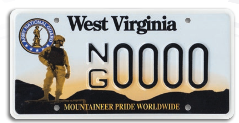
ARMY NATIONAL GUARD