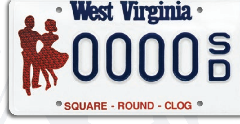
WV SQUARE & ROUND DANCE FEDERATION*