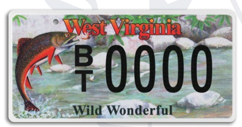
WILDLIFE - BROOK TROUT