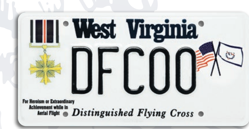
DISTINGUISHED FLYING CROSS