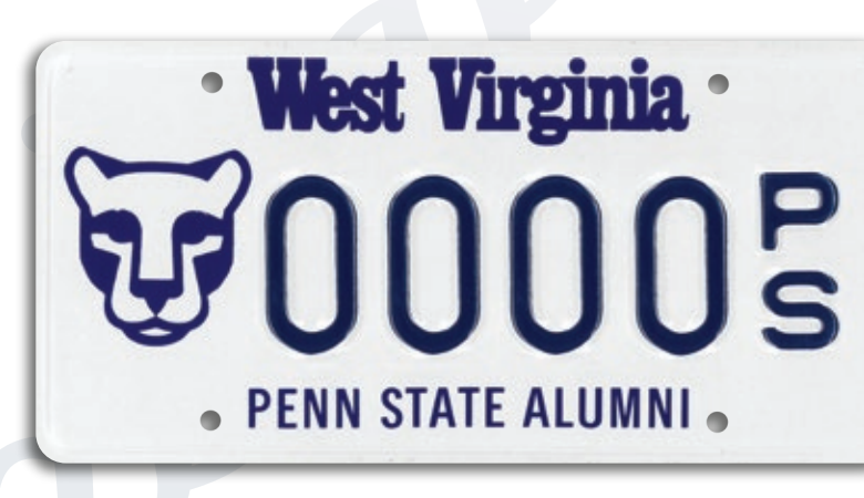
PENN STATE ALUMNI