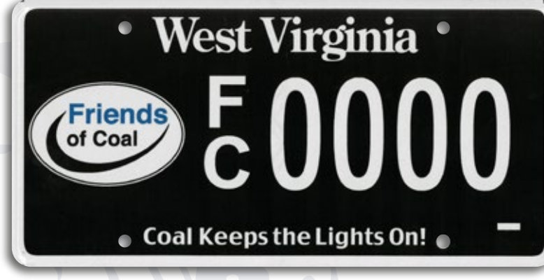
FRIENDS OF COAL