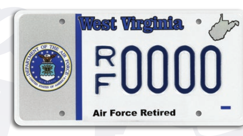
AIR FORCE RETIRED