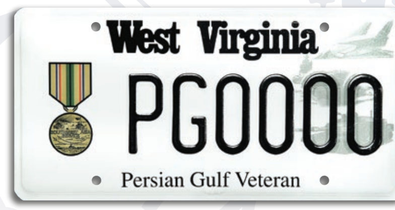
PERSIAN GULF VETERAN