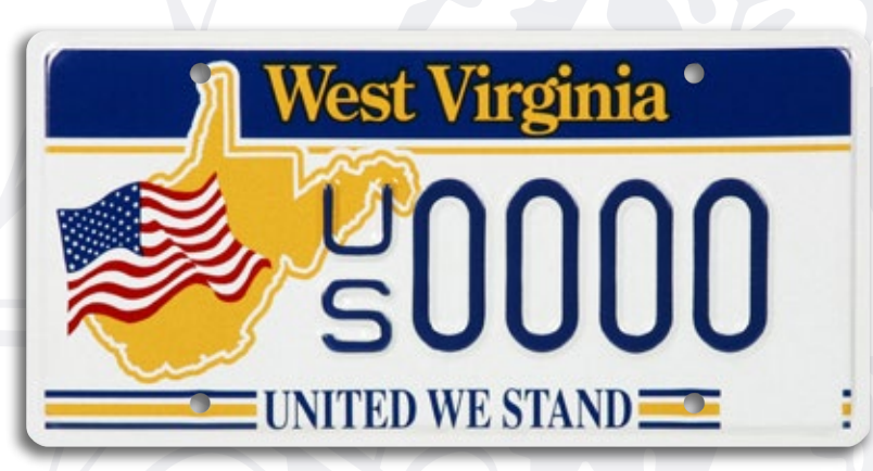
PATRIOTIC - UNITED WE STAND*