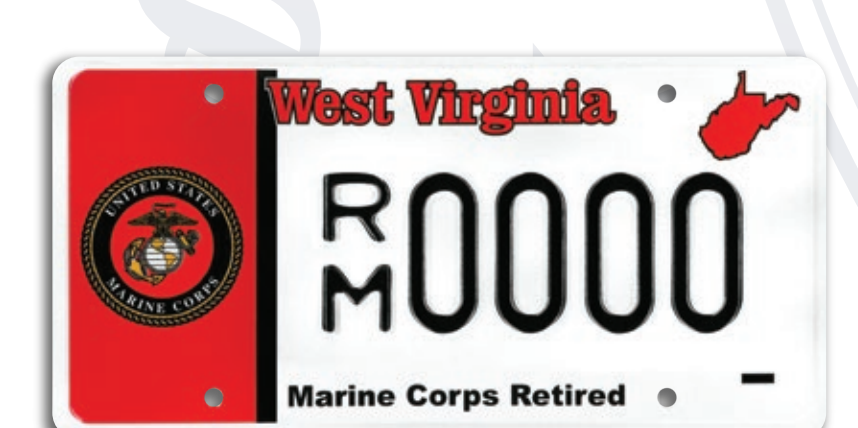
MARINE CORPS RETIRED