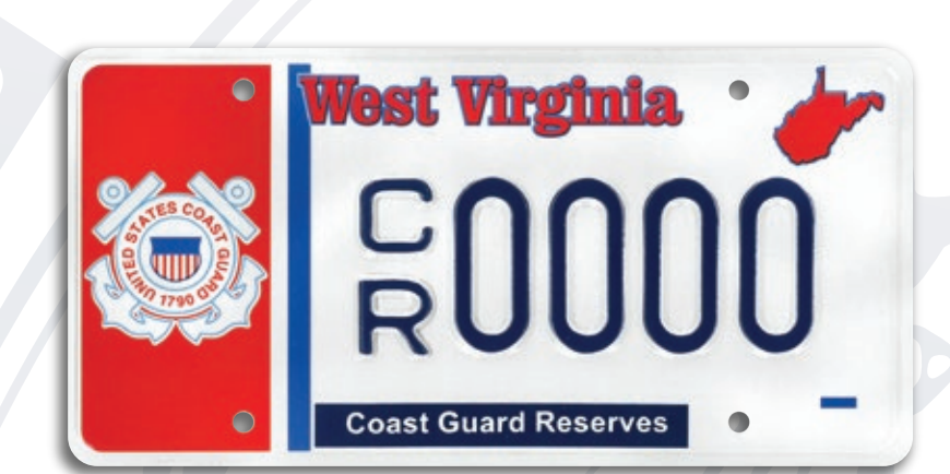
COAST GUARD RESERVES