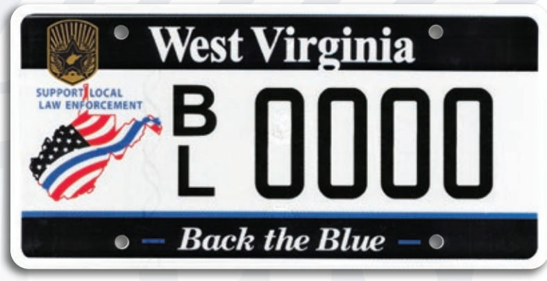
BACK THE BLUE: WOUNDED IN THE LINE OF DUTY