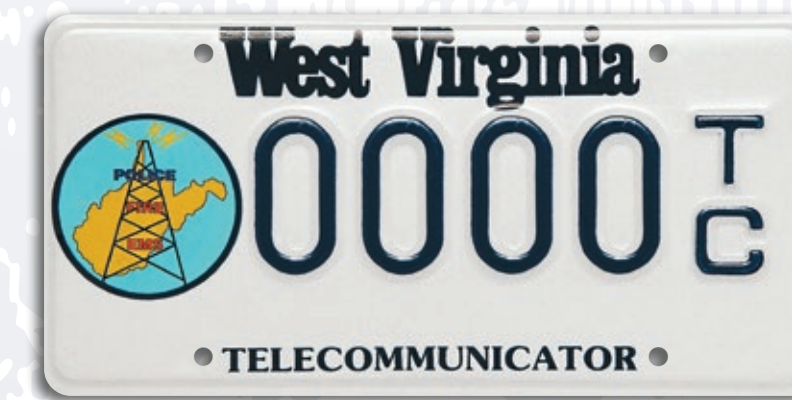
TELECOMMUNICATOR (9-1-1 ENHANCED)