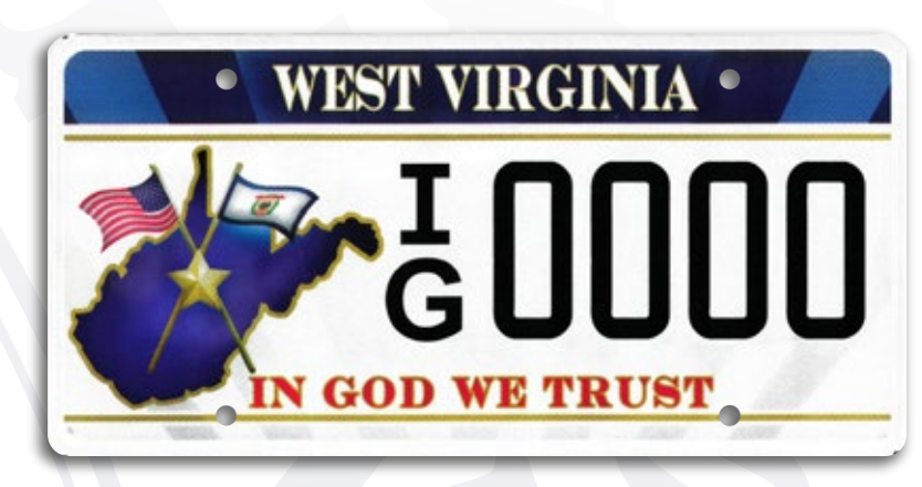
IN GOD WE TRUST