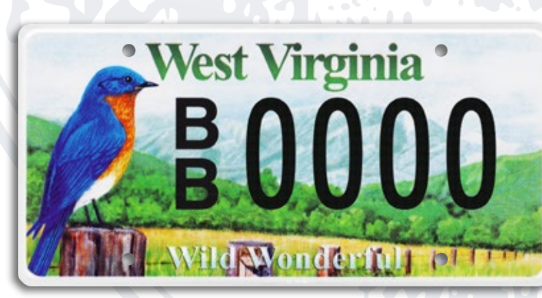
WILDLIFE - EASTERN BLUEBIRD