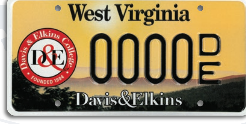
DAVIS & ELKINS