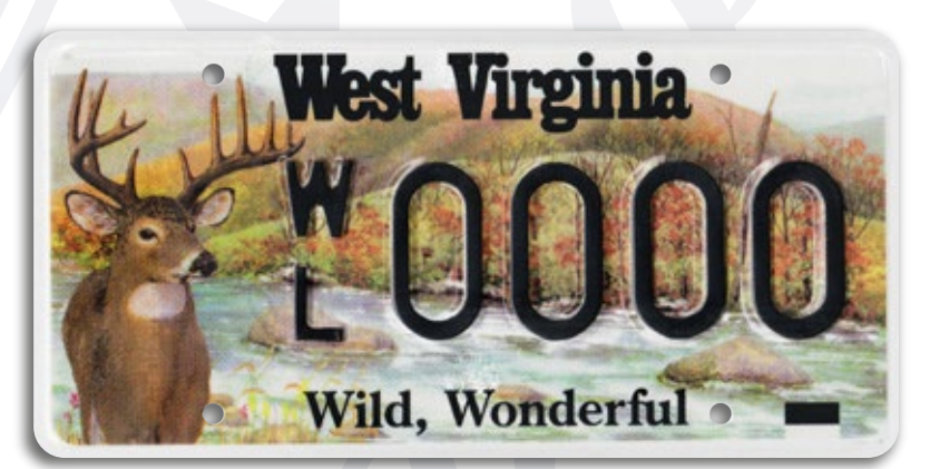
WILDLIFE - WHITETAIL DEER*