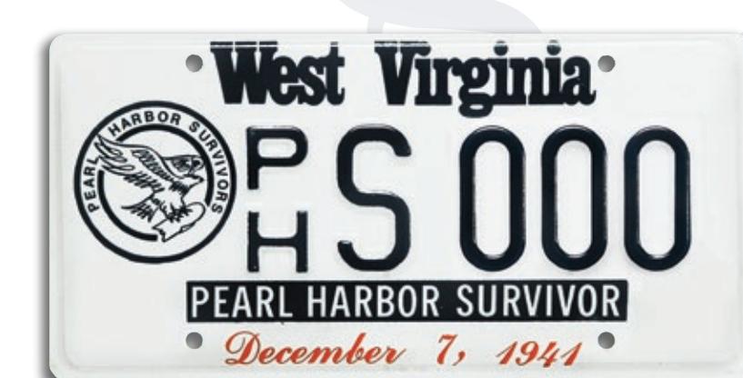
PEARL HARBOR SURVIVOR