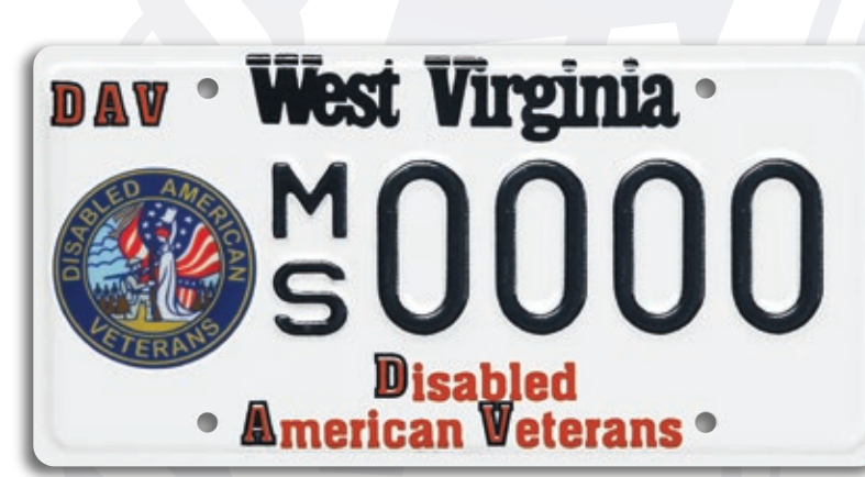
DISABLED AMERICAN VETERANS