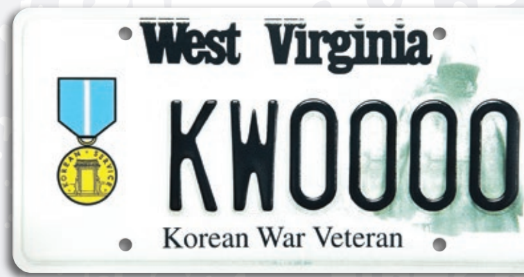
KOREAN WAR VETERAN