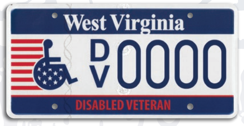
DISABLED VETERAN - MOBILITY IMPAIRED