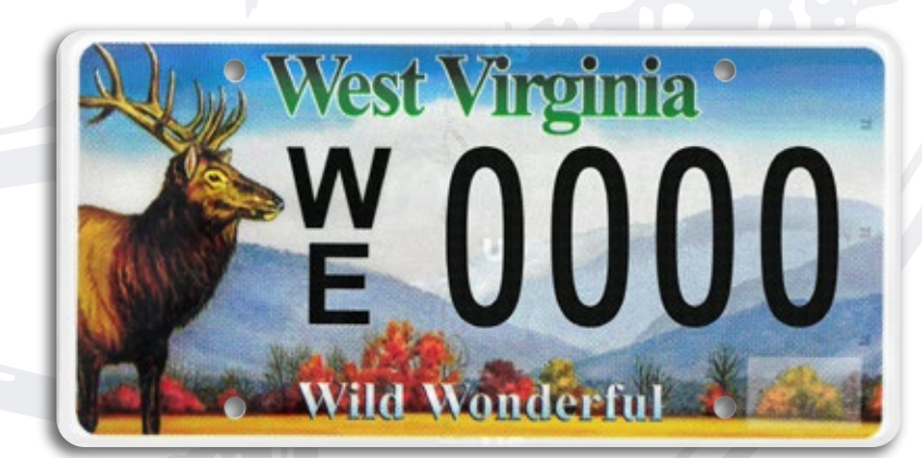
WILDLIFE - ELK