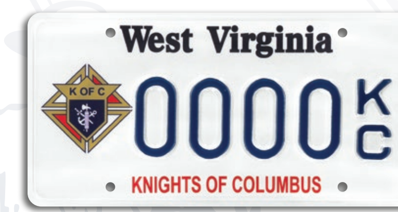
KNIGHTS OF COLUMBUS