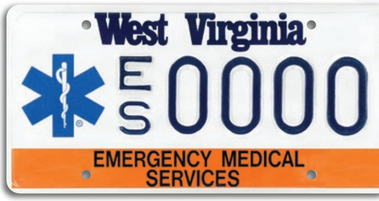
EMERGENCY MEDICAL SERVICES