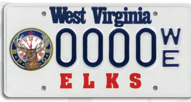
BENEVOLENT PROTECTIVE ORDER OF ELKS