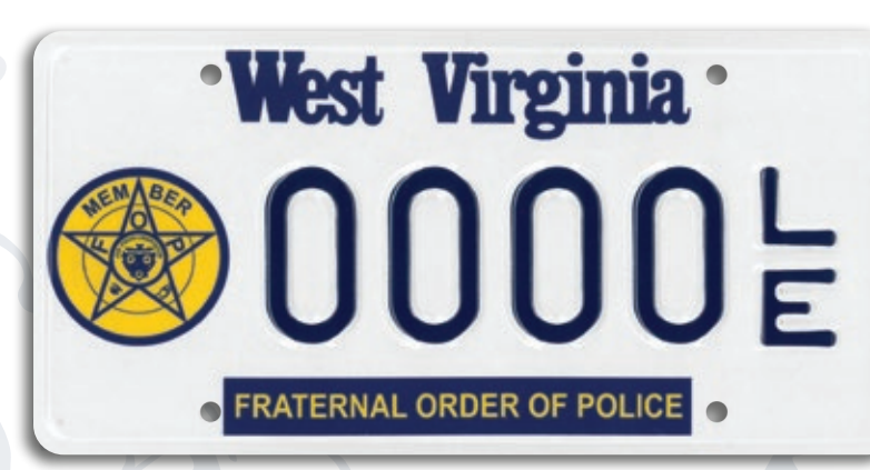
FRATERNAL ORDER OF POLICE