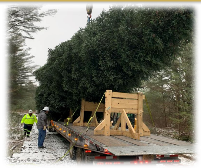
Loading the tree in Randolph County.