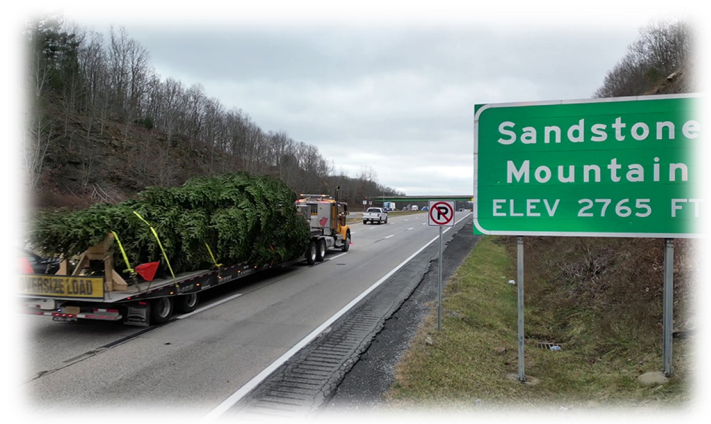
Climbing Sandstone Mountain.