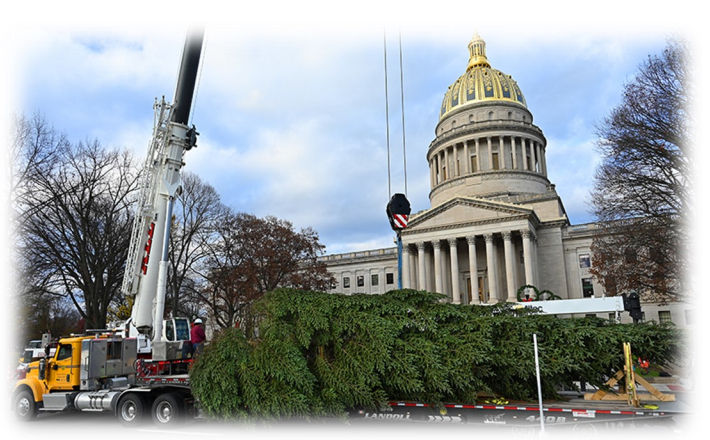
The tree arrives in Charleston.

Hunting season isn't the only factor threatening West Virginia's deer population. According to insurance statistics, the Mountain State leads the nation in deer strike accidents function as one West Virginia Department of Transportation.