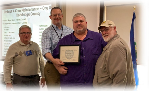
District 4 — Doddridge County