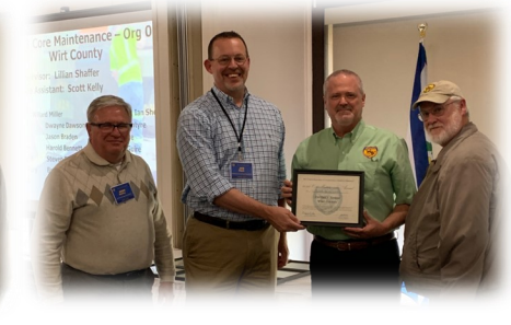
District 3 — Wirt County