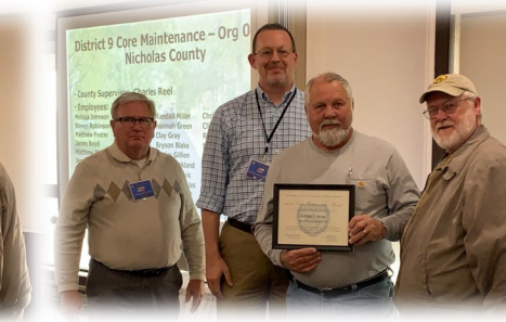
District 9 — Nicholas County