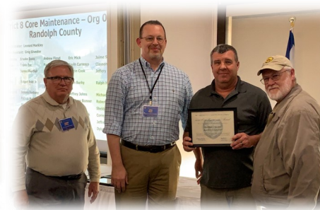
District 8 — Randolph County