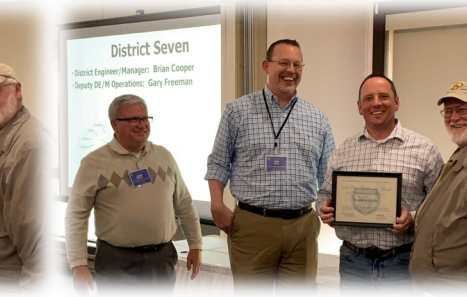
Best Overall — District 7