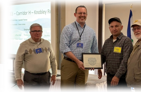
Best Expressway — Corridor H Knobley Road