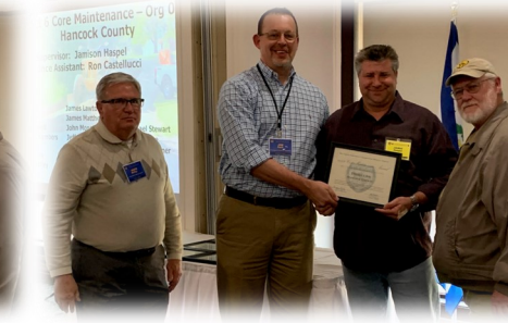
District 6 — Hancock County