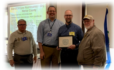
District 10 — Mercer County