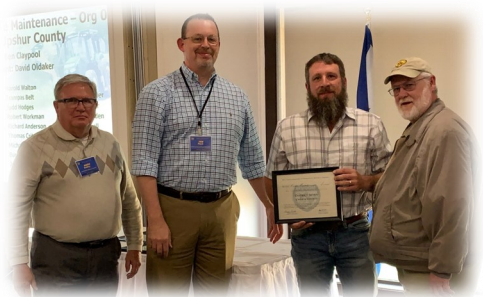
District 7 — Upshur County