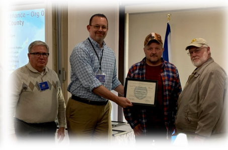
District 2 — Lincoln County