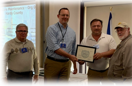
District 5 — Hardy County