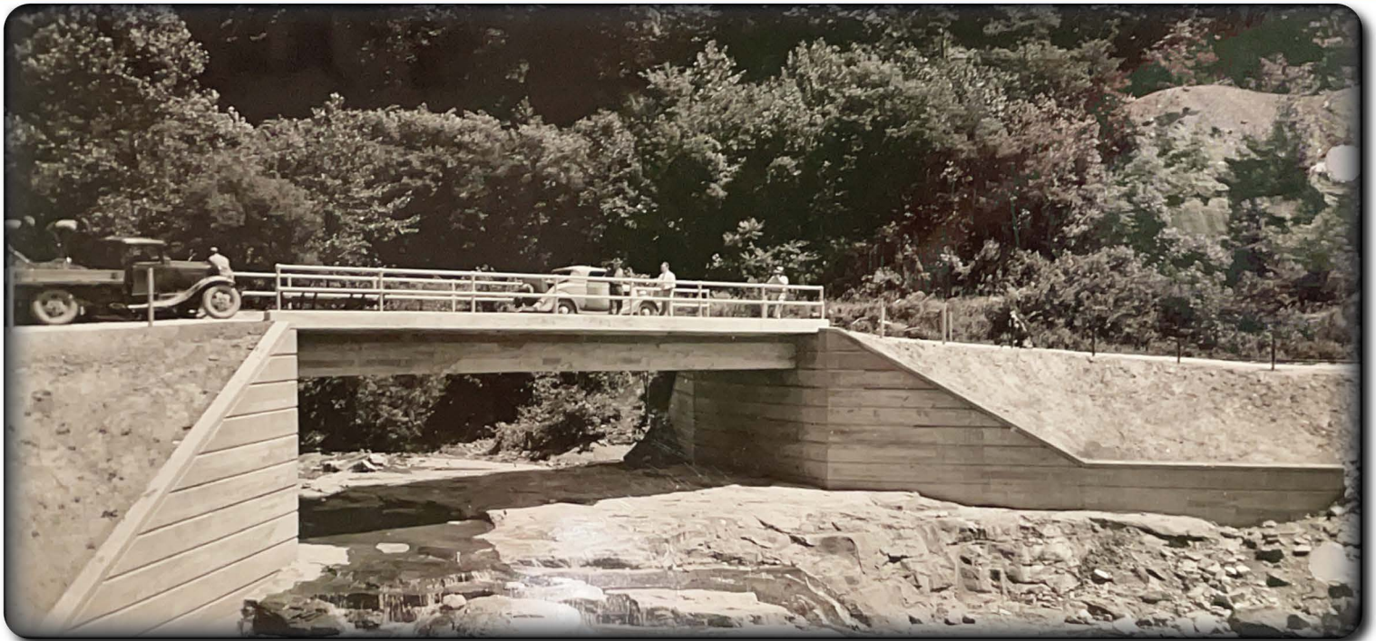
Newly constructed bridge crossing Mills Creek, Fayette County, 1936.