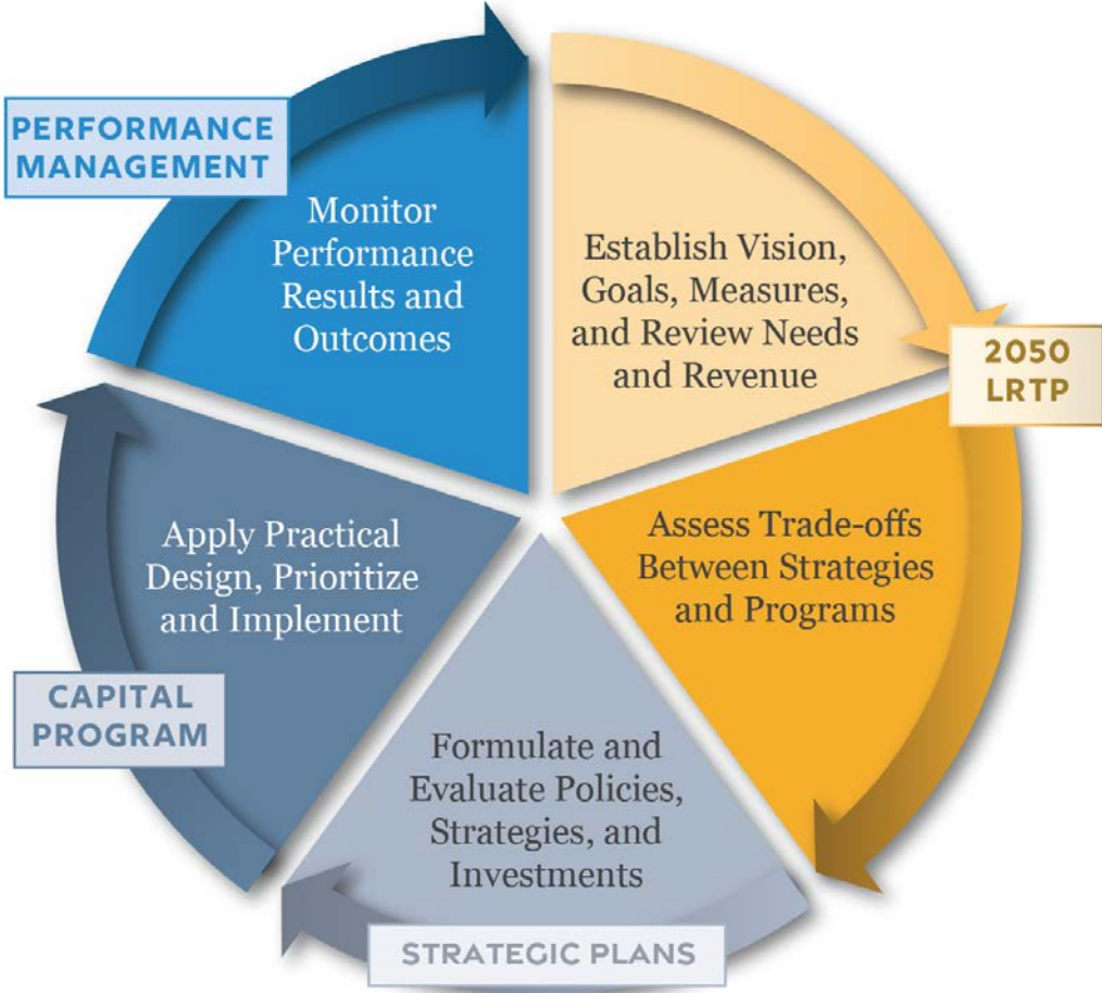
WVDOT's Transportation Planning Lifecycle

The LRTP helps WVDOT plan strategically , program capital investments , and manage performance guided by statewide transportation goals which maximize opportunities and reduce risks as transportation needs and revenues change.