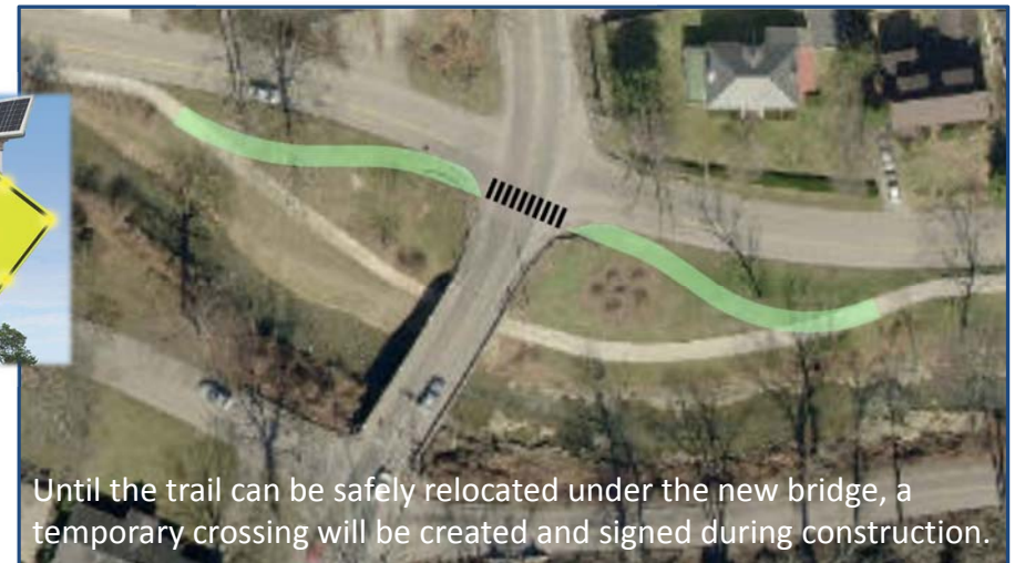
Until the trail can be safely relocated under the new bridge, a temporary crossing will be created and signed during construction.