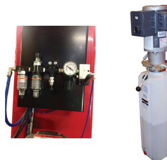
North American Power Unit / Air Mechanical Locking System with Regulator