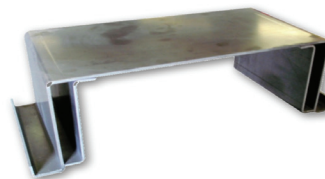
24"/ 610mm Double Wall Non Sag Runways

TOTAL AUTOMOTIVE LIFTING SOLUTIONS INC. 2300 SPEERS RD OAKVILLE, ON L6L 2X8 PHONE (877) 799-5438 FAX (905) 891-1214