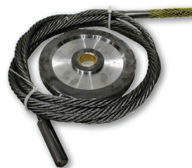
13"/ 330 mm Machined Pulleys with 5/8" / 15.9mm Cables