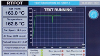
Real-time temperature/time graph