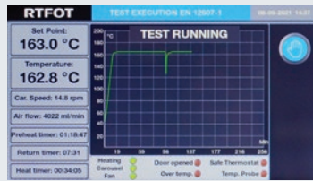
Real-time temperature/time graph