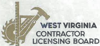
Chair, West Virginia Contractor Licensing Board

A copy of this license must be readily available for inspection by the Board on every job site where contracting work is being performed. This license number must appear in all advertisements, on all bid submissions, and on all fully executed and binding contracts. This license is non-transferable. This license is being issued under the provisions of West Virginia Code, Chapter 30, Article 42.