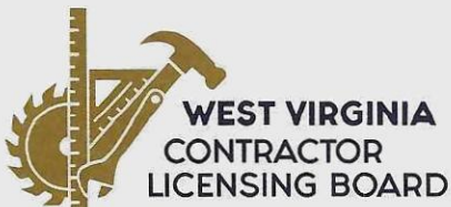
Chair, West Virginia Contractor Licensing Board

A copy of this license must be readily available for inspection by the Board on every job site where contracting work is being performed. This license number must appear in all advertisements, on all bid submissions, and on all fully executed and binding contracts. This license is non-transferable. This license is being issued under the provisions of West Virginia Code, Chapter 30, Article 42.