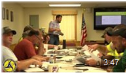
DOT-12 Training Update