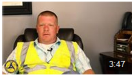
WVDOH New Equipment 5.2K views · August 21

Hear your co-workers voices and stories on WVDOT's Facebook and YouTube.