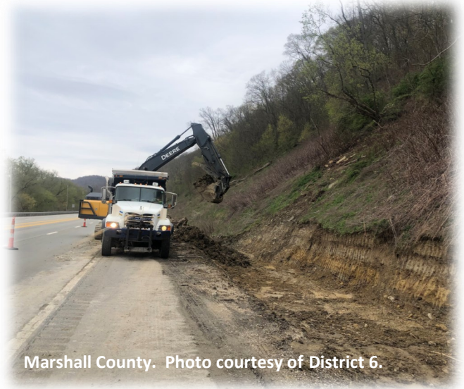
Marshall County.