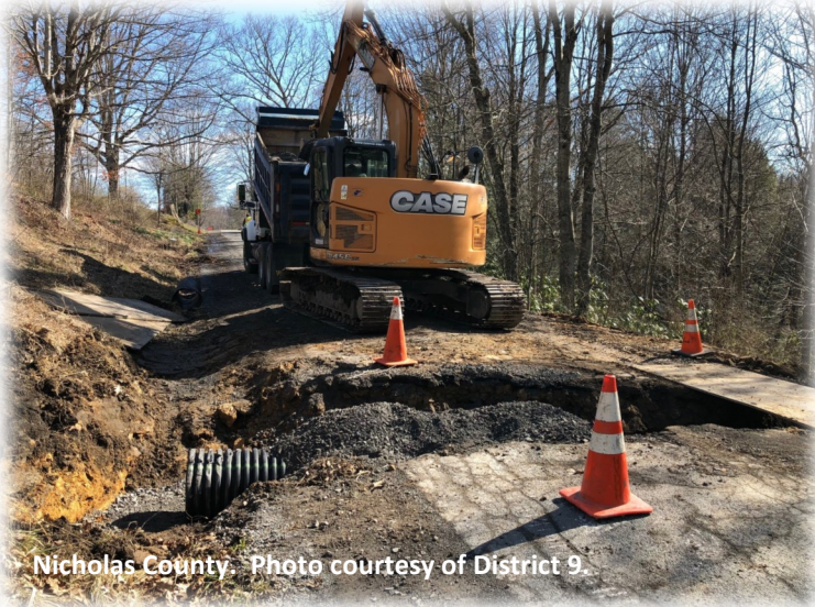
Nicholas County.