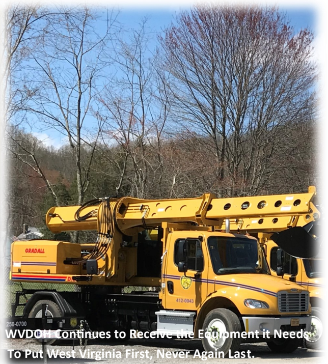
WVDOH Continues to Receive the Equipment it Needs To Put West Virginia First, Never Again Last.