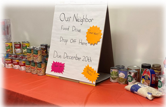
District 7 Food Drive