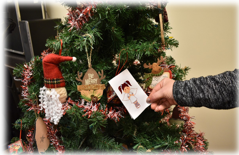
District 1 Angel Tree