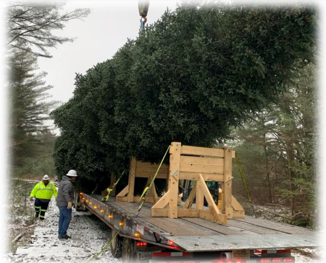
Loading the tree in Randolph County.