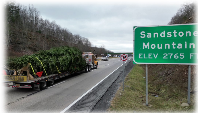
Climbing Sandstone Mountain.