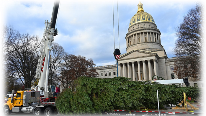
The tree arrives in Charleston.