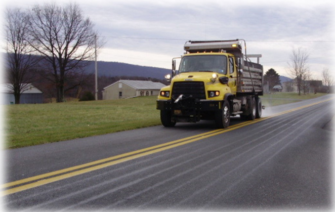
Jan 17 2022, 12:59:05 AM