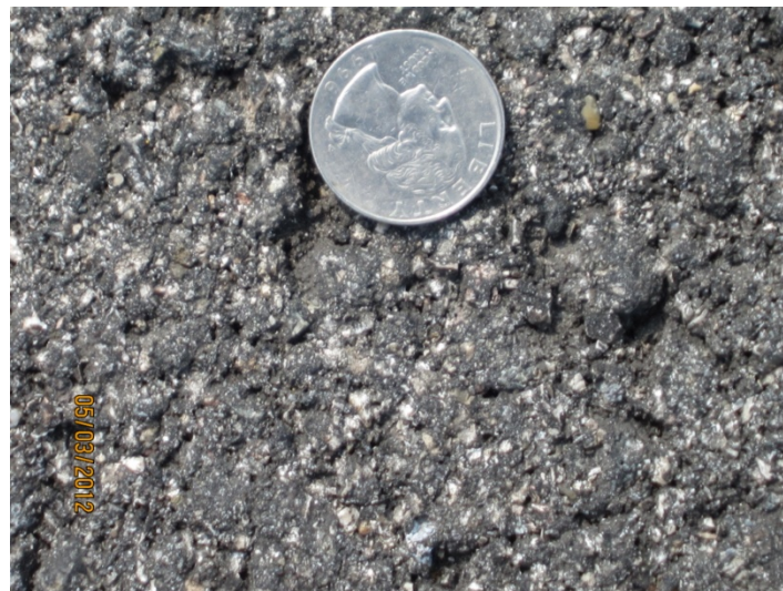
Photo showing close view of raveling from photo above.