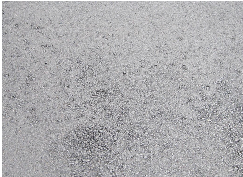
Segregation in new asphalt pavement, Superpave 9.5 mm mix.

A segregated mat can result from a number of factors ranging from the aggregate stockpiles at the asphalt mixing plant to the paving equipment at the project site. If segregation is widespread over several hundred feet of continuous pavement, removal and replacement of the affected area is probably the best option. When the segregated areas are discontinuous or “spotty,” removing and replacing various areas introduces a number of new construction joints. This scenario may often be less desirable than the original, segregated mat. In these cases, a fine-textured seal course is an option to consider for the affected locations.