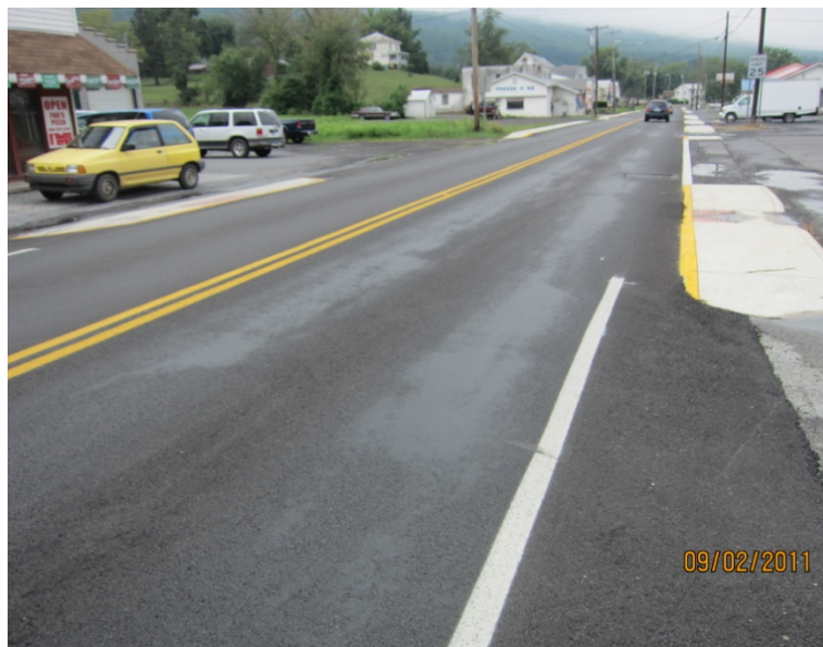
Excessive Bleeding and Flushing along wheel paths in new asphalt pavement.

See the photos below for examples of flushing, bleeding, and fat spots.