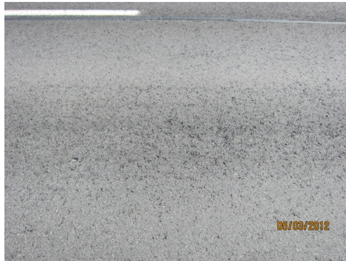
Photo shows excessive raveling of pavement within an area of segregation during first year of service – 12.5 mm Superpave mix.