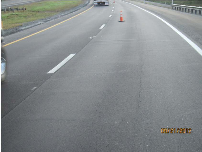
Photo showing excessive transverse bumps and associated transverse tearing as well. This photo also shows longitudinal cracking in the center of the mat.

loading to which the pavement is subjected. In such severe cases, the likely best action is removal and replacement of the affected area.