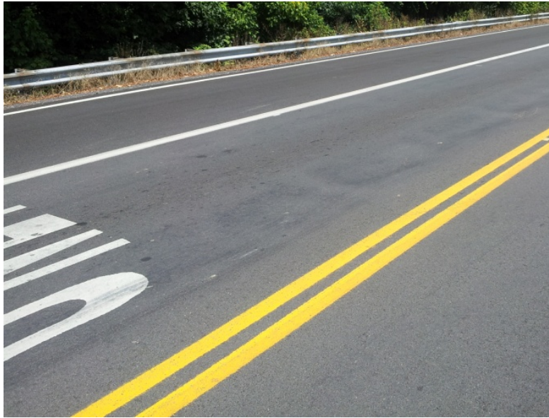
Excessive rutting and shoving in new asphalt pavement. Note the displacement of the road lettering. Also note the presence of corresponding flushing of liquid asphalt.