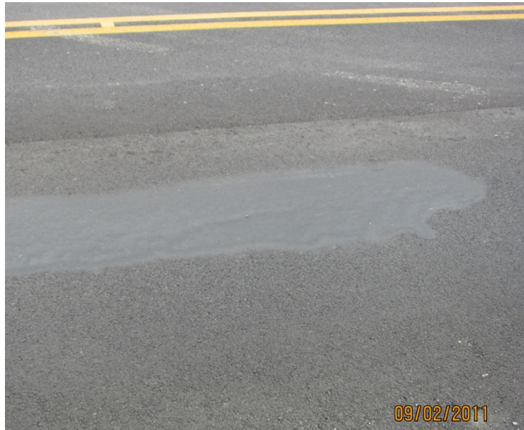
Excessive Fat Spot in new asphalt pavement.

Additional guidance on the evaluation of and severity of flushing can be found in Standard Specifications Section 410, Part 410.7.4 and use of MP 401.07.24.