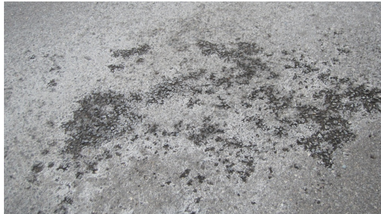
Photo shows advanced raveling and segregation of a Superpave 12.5 mm mix.

As with segregation, if the raveling is widespread and generally continuous, removal and replacement of the affected area is probably the best option. Excessive raveling and segregation can result in premature cracking of the asphalt pavement. However, when the raveled areas are discontinuous, removing and replacing various unconnected areas introduces a number of new construction joints. This scenario may often be less desirable than the original pavement. In these cases, a fine-textured seal course or micro surfacing may be an option to consider for the affected locations.