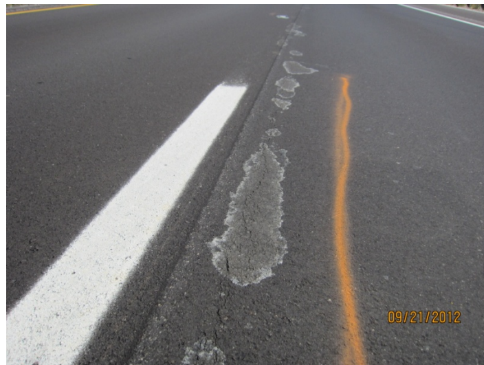
Tear in new asphalt pavement. Note water stains along cracks. Area has been marked for repair.