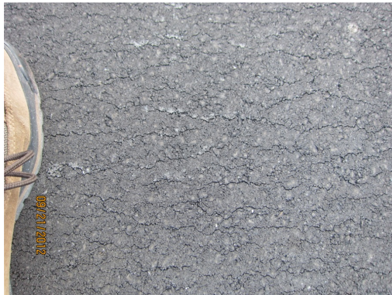
Typical observations of checking in new asphalt pavement – Superpave 9.5 mm mix.